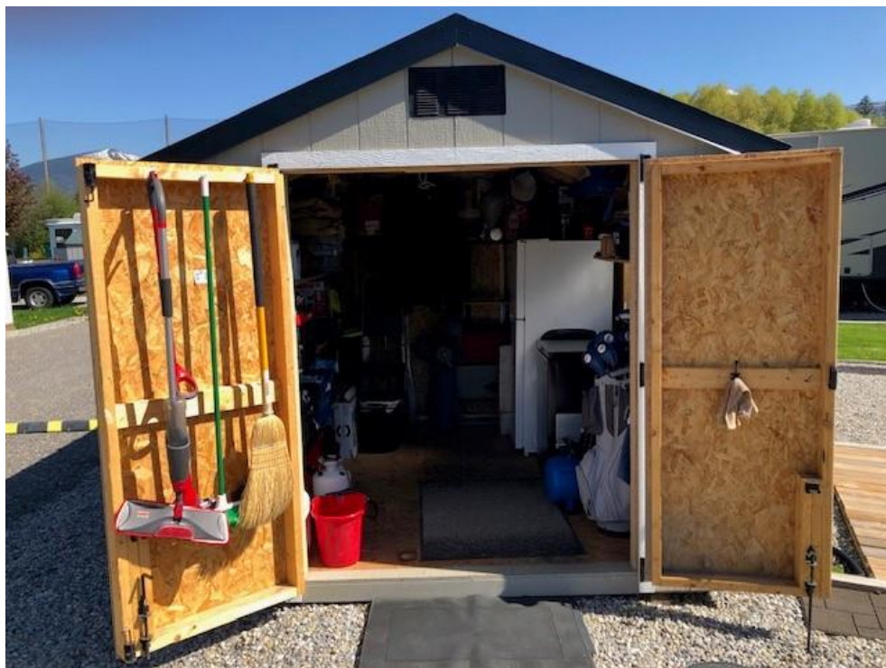
Surface Deck 8' x 16'