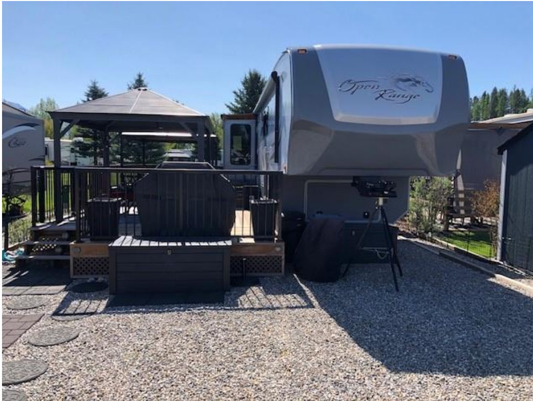
Rear View with Living Room Slide Out